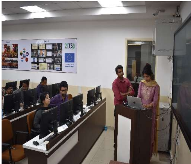
21st TS Team, SLS Pune addressing the participants on hybrid mode