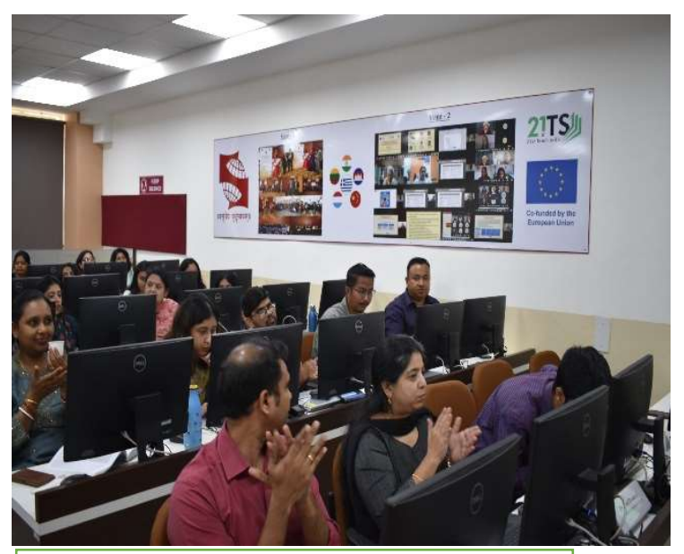
Participants and Trainers attending the orientation session on the 21st Teach Skills Certificate Program

Imbibing 21st century skills will provide students with a winning edge over others. It would prepare them to take up leadership roles in the digital age and would enable them to shine as job creators. It will also motivate them for lifelong learning.