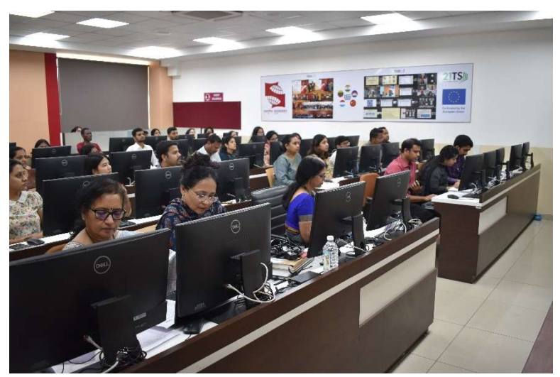
Participants attending the orientation session on the 21st Teach Skills Certificate Program

The orientation program provided the necessary handholding to the participants regarding registration on the platform and the assessment plan.