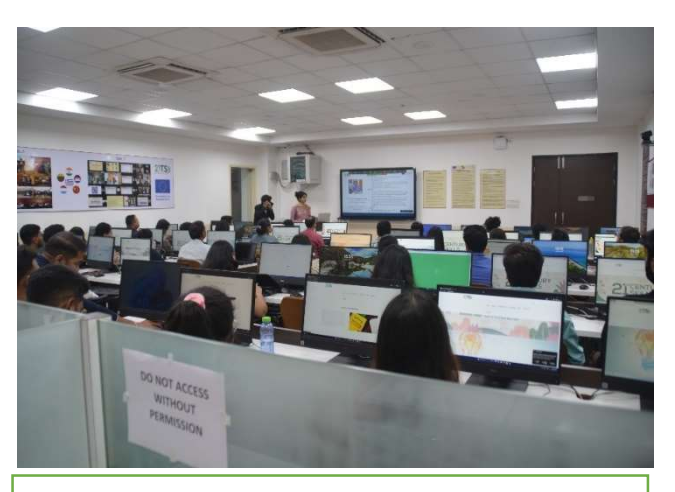
Participants attending the orientation session on the 21st Teach Skills Certificate Program

Further, team of SCES/SLS Pune took the participants through the project journey and told them about the development of the 4 modules by the participating HEIs. She informed the participants about the 4 modules that were developed namely on 'Teaching Critical Thinking Collaborative Problem-Solving Skills', 'Education Technology Skills', 'Authentic Tasks', and Learning 'Optimizing Assessment for 21st Century Skills'.