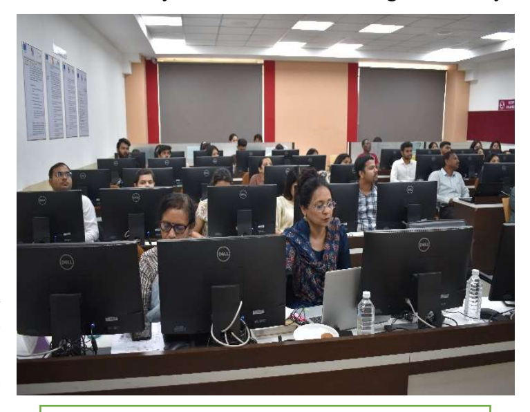
Participants attending the orientation session on the 21st Teach Skills Certificate Program